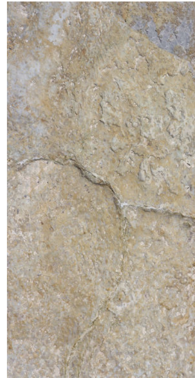
NATURAL CLEFT COLOR EXAMPLE