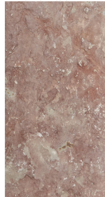
NATURAL CLEFT COLOR EXAMPLE

GEOLOGY: dolomitic limestone- quarried in USA COLOR RANGE yellows & creams to slight buffs & cool grays, mottled with occasional fossils; swirls are common COLOR CONSISTENCY PER BLOCK/SLAB somewhat consistent depending application WEIGHT CALCULATED IN INCHES l x w x h / 1728 (inches cubed) x 177 = approx 177 pounds per cubic foot ASTM TESTING DATA CHILTON C97 water absorption—0.08% CHILTON C97 density—177.4 pcf CHILTON C99 modulus of rupture—1,220 psi CHILTON C170 compressive strength w/rift—50,560 psi compressive strength across rift—38,090 psi CHILTON C880 flexural strength—3,070 psi