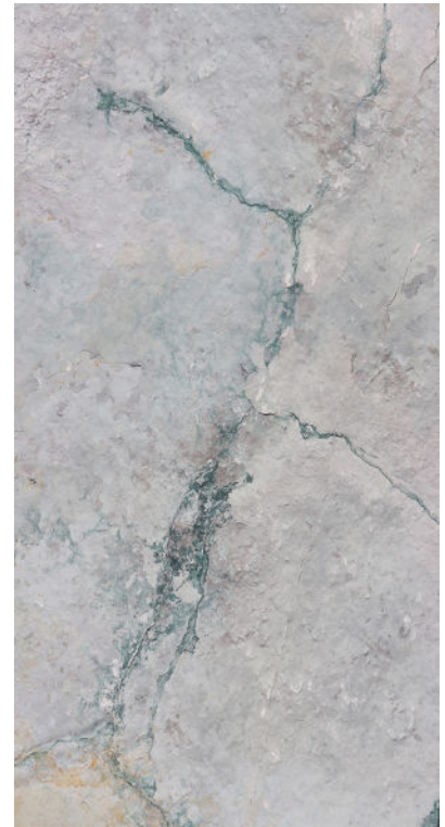
NATURAL CLEFT COLOR EXAMPLE